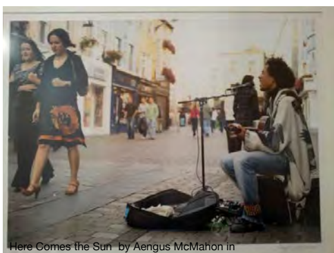
Here Comes the Sun by Aengus McMahon in NUIG Art Collection