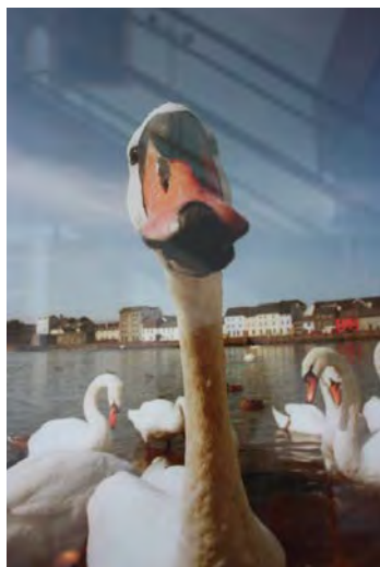
Talkative Swan by Pat O'Connor in NUIG Art Collection