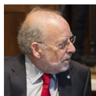
Patrick Honohan former Governor, Central Bank of Ireland